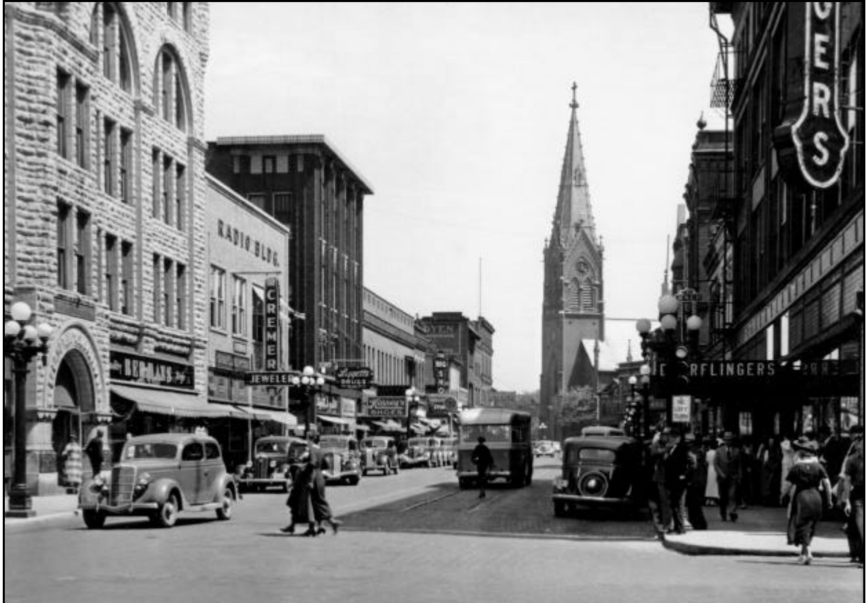
Main Street, La Crosse, WI. About 1940.

“Main Street: Building Wisconsin Communities”