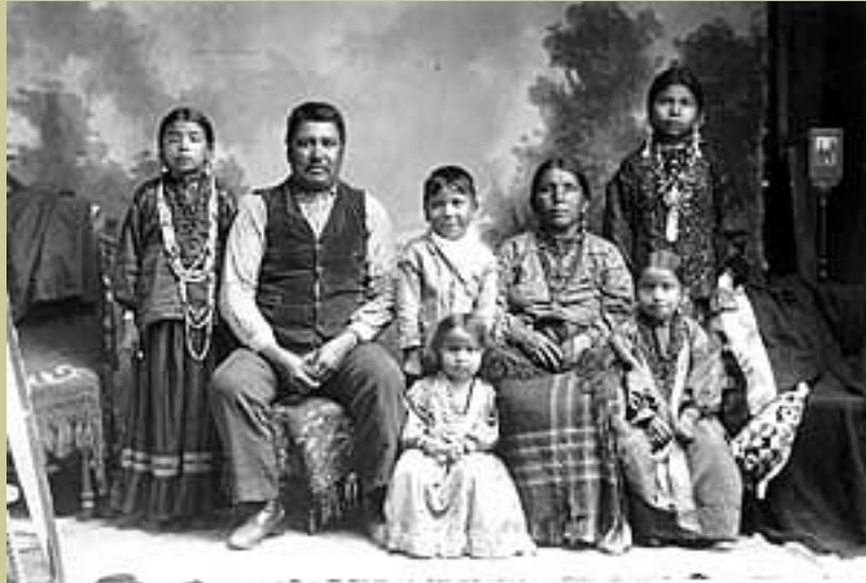
Family from the Ho-Chunk Nation, Black River Falls, Wisconsin. WHi(X3)41431.