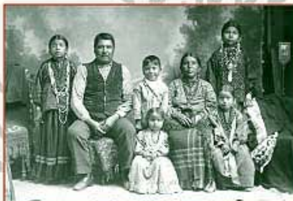
Ho-Chuk-Indian family, Black River Falls, WI

Wisconsin Historical Society photo WHS (A3) 41431 Charles Van Schaick Collection