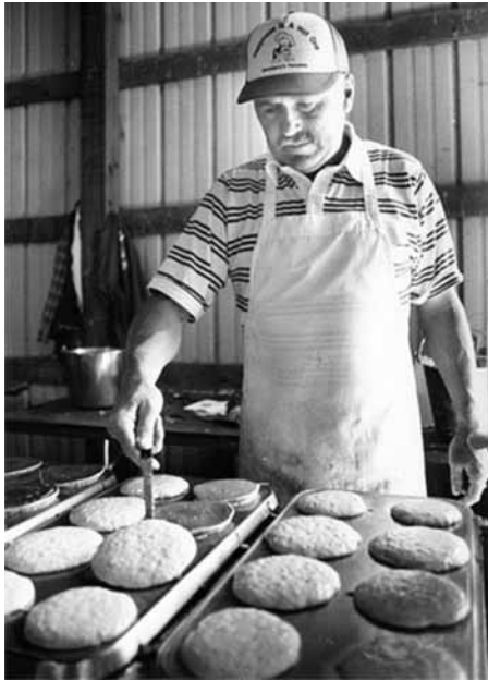
Man flipping pancakes at "farm breakfast" as part of "June is Dairy Month" promotion in Washington County, 1989.