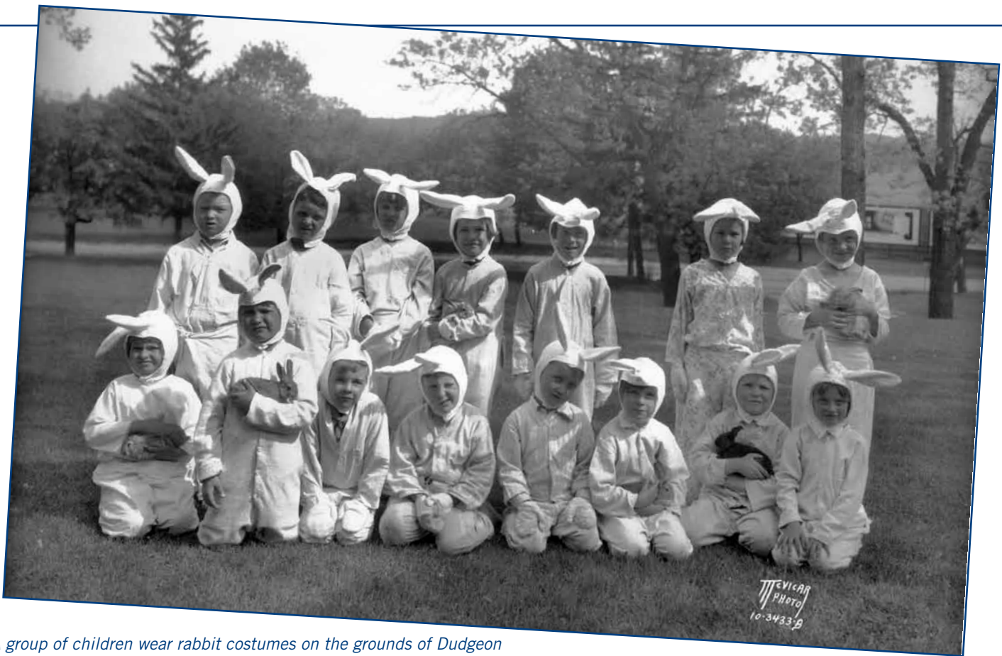
A group of children wear rabbit costumes on the grounds of Dudgeon School, 3200 Monroe Street. May 19, 1932.

If you like to share history with children and their families, please consider signing on for one or more of our summer educational activities. It will bring out the kid in you!