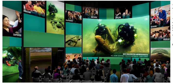
Concept exhibit design rendering

A 1,200-year-old Native American dugout canoe was recovered in late 2021 from Madison's Lake Mendota (left) and added to the Society's world-renowned collection of nearly 300 million items. The new museum will have the technology to host virtual programming through which residents anywhere can engage with Society maritime archaeologists and others in conversations about the canoe's story and its discovery and recovery.