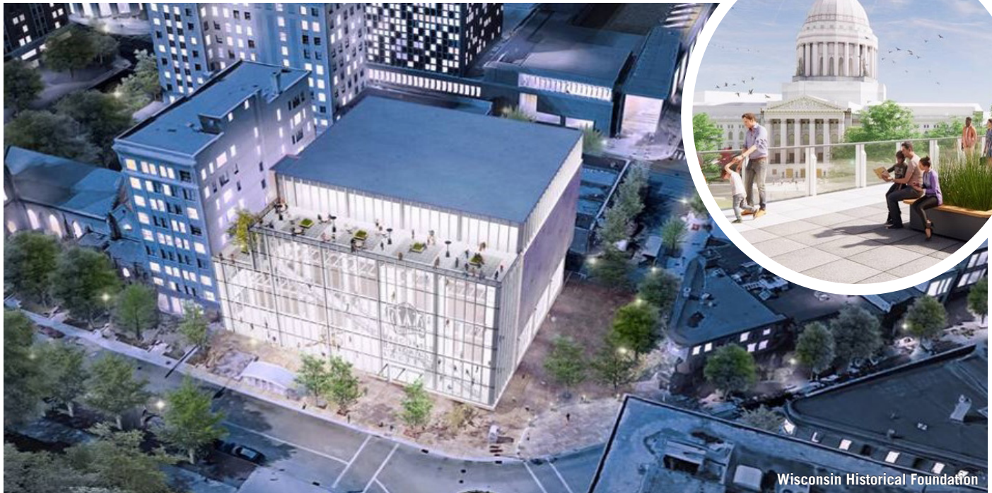
Wisconsin Historical Foundation

New museum will be a national attraction on Wisconsin's Capitol Square