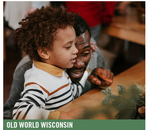
OLD WORLD WISCONSIN