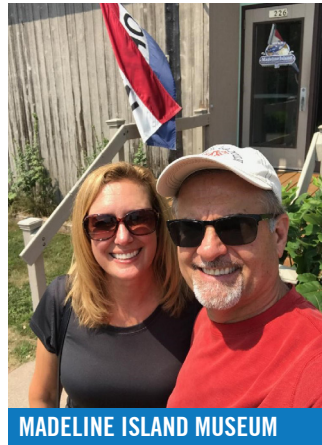
MADLINE ISLAND MUSEUM