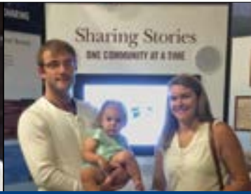
"Wisconsin History Tour" visitors