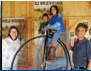
A family enjoys the "Wheel Fever" exhibit