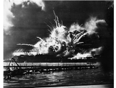
USS Shaw Exploding

On December 7, 1941, the United States naval base at Pearl Harbor was attacked by the armed forces of Japan. The attack came with little or no warning to the men and women stationed in Hawaii. One of the most destructive sea battles of the war, it lasted just over 90 minutes. The United States suffered over 2300 service members and civilians killed in action and another 1,000+ wounded.