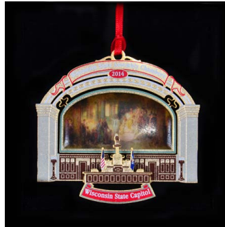
2014 Capitol Ornament

Say "Happy Holidays" from Wisconsin, and support the museum by shopping at the Wisconsin Historical Museum Store's 12th Annual Holiday Sale!