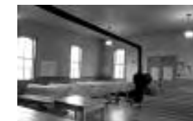
Daniels Town Hall interior

Sisson's Peony Gardens, Rosendale, Fond du Lac County