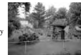
Sisson's Peony Gardens