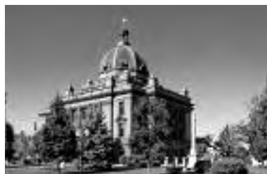
Lancaster Courthouse Square

West Allis and Whitewater will use the money to conduct intensive surveys of his-