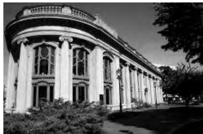
The south face of the Milwaukee County Historical Society

In addition to its main center, the MCHS operates three historic house museums that date back to the 1840s: the Kilbourntown House in Shorewood, the Lowell Damon House in Wauwatosa, and the Jeremiah Curtin House in Greendale. They recently acquired Trimborn Farm in Greendale, a nine-building, Civil War era farmstead in the midst of a major metropolitan area.