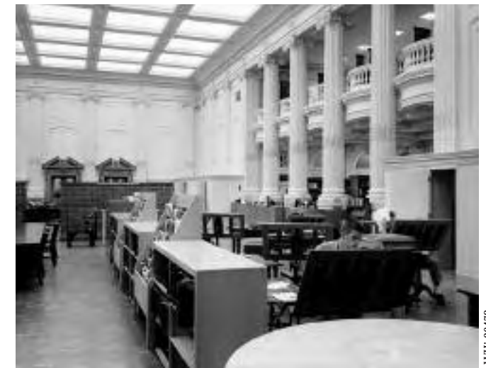
The Reading Room at Society Headquarters

Both studies should be complete in the coming months and will play a key role in protecting the Reading Room and making it more accessible to visitors.