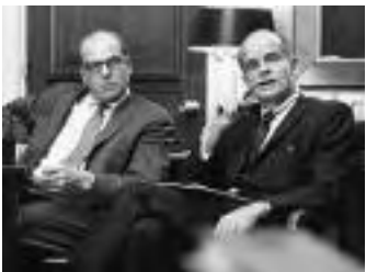
Wisconsin Senators Gaylord Nelson and William Proxmire