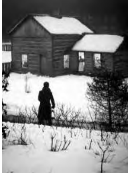
Finnish immigrants prepare for the holidays at Old World Wisconsin

Winter events at the sites will make you laugh, sing, dance, eat, and have the historical adventure of your life. Chat with Father Christmas over a hearty breakfast, enjoy a holiday dinner with all the trimmings followed by a walk-along production of the Charles Dickens classic A Christmas Carol , or take a lamplight tour of the immigrant farmsteads, all at Old World Wisconsin.