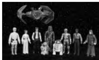
Star Wars figures

“Toy Stories” , 17 October through 26 May 2007. This historical look at popular toys and games from the 1940s to the present includes classics plus toys with intriguing Wisconsin connections.