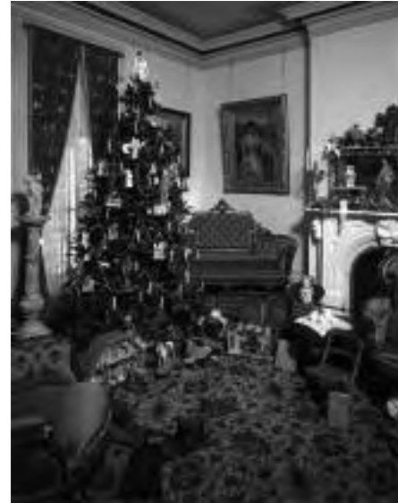
An 1890s Christmas at Villa Louis