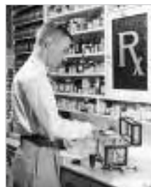
Pharmacist in Madison, 1950

AIHP Archives is the records of the United States Pharmacopeia (USP), the non-profit organization that has for more than 180 years established the formulas and set the standards for quality and consistency of medicines in the United States and around the world. Recently, USP transferred an additional 80 cubic feet of records to the Society's Library-Archives. Along with the records came a grant of nearly $8000 to assist with work on the USP collection. The Library-Archives Division is grateful to USP for providing money to make this important collection more accessible to researchers.