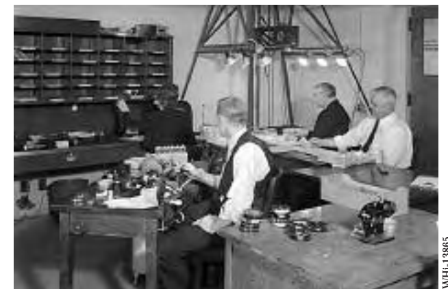
Three men make microfilm copies at the State Office Building in 1942