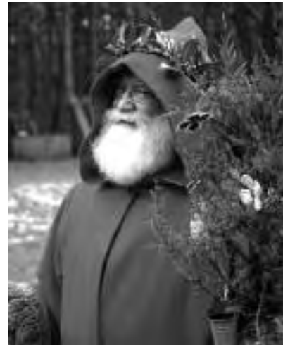
Father Christmas at Villas Louis