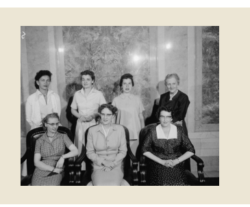
A group photo of the <u>wives of</u> <u>Wisconsin's seven Supreme Court</u> Justices in 1958