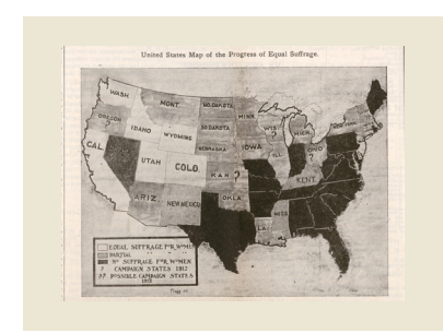
A 1912 map showing where women could vote with a question mark on Wisconsin.