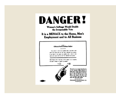
Anti-woman suffrage poster from 1912 that reads, "Danger! Women's Suffrage would double the irresponsible vote!"