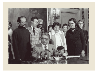
1975 men and women watch as <u>Governor Patrick Lucey signs</u> <u>the still proposed Equal Rights</u> Amendment