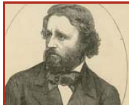
John C. Fremont.