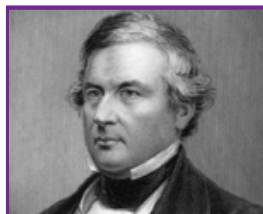
Millard Fillmore.