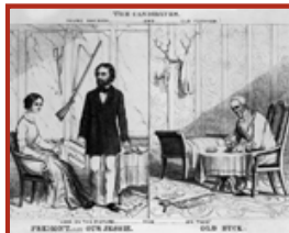
Pro-Fremont political cartoon, 1856. WHI-56907