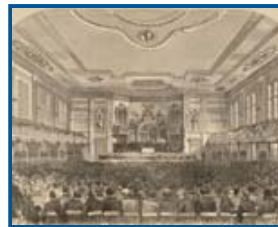
Democratic National Convention, Charleston, SC, April 23, 1860. Harper's Weekly , April 28, 1860. WHI-57009