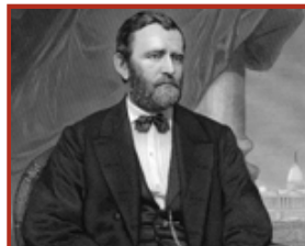
Ulysses S. Grant.