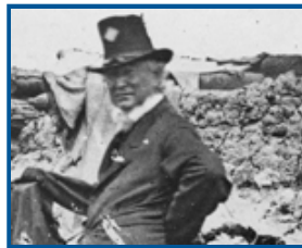
Horace Greeley with the Union Army.