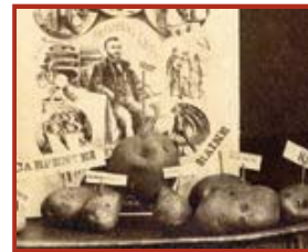
Pro-Grant window display, Whitewater, WI, 1872. WHI-56969