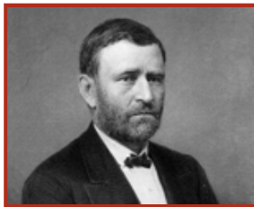
Ulysses S. Grant. WHI-24120