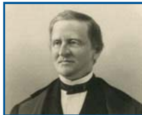
Samuel J. Tilden. WHI-56979