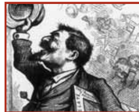
Cartoon for Republican presidential candidates. Harper's Weekly , July 8, 1876. WHI-56945