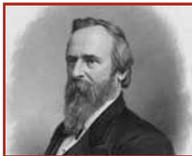
Rutherford B. Hayes. WHI-27953