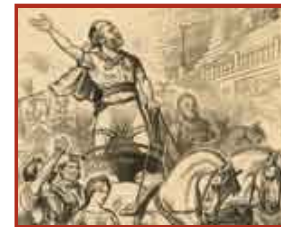
Garfield victory cartoon. Harper's Weekly , November 20, 1880. WHI-56894