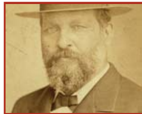
James A. Garfield. WHI-34216