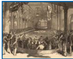
Democratic National Convention, Cincinnati. Harper's Weekly , July 10, 1880. WHI-56886