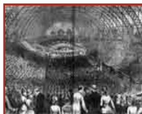
George F. Hoar addresses the delegates at the Republican National Convention, Chicago. Frank Leslie's Illustrated Newspaper , June 1880. WHI-56997