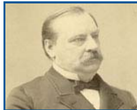
Grover Cleveland. WHI-8104