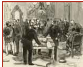
The Blaine headquarters at the Republican National Convention, Chicago, 1884. WHI-56916