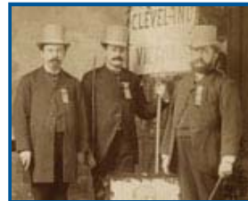
Milwaukee delegates to the Democratic National Convention, Chicago, July 10, 1884. WHI-56914