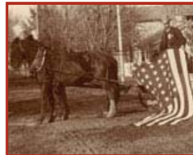
Campaigning for Benjamin Harrison and Levi Morton, possibly Madison, 1888.