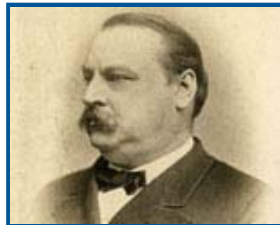
Grover Cleveland. WHI-23780.