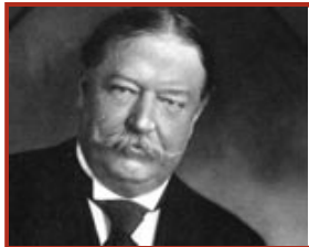
William H. Taft.