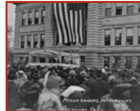
William Taft visits Green Bay, October 26, 1911. WHI-56912