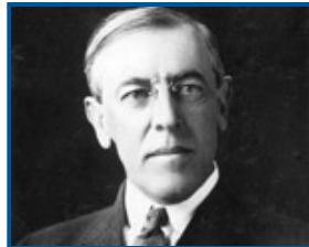
Woodrow Wilson.