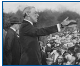
Woodrow Wilson campaigns in New Jersey, October 28, 1916. WHI-9675