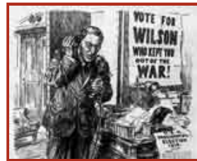
Anti-Wilson political cartoon. Punch , October 18, 1916. WHI-56962