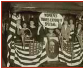
Campaign train for Charles Hughes, 1916. WHI-56989