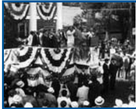
Franklin D. Roosevelt speaks in Green Bay, August 9, 1934.