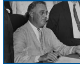
Franklin D. Roosevelt signs the Social Security Bill, August 14, 1935.