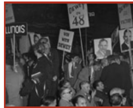
Republican National Convention, Philadelphia, June 1948. WHI-56888