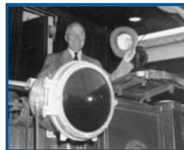
Harry S. Truman in Madison, September, 1947.