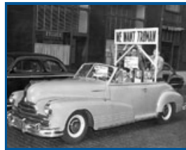
A carload of Truman supporters in Pennsylvania, 1948. WHI-22948