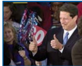
Al Gore campaigns in Madison, October 26, 2000.