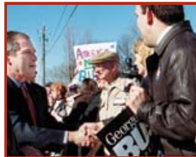
George W. Bush greets a crowd during a campaign stop in Eau Claire, May 24, 2000.