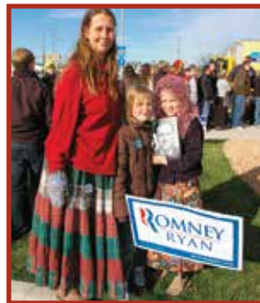
Romney supporters at a Paul Ryan Rally Event in La Crosse, October 30, 2012