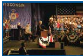
Joe Biden speaks at a Democratic Election rally at the University of Wisconsin-La Crosse, October 12, 2012

Paul Ryan of Janesville became the first Wisconsinite to appear on a major party presidential ticket.